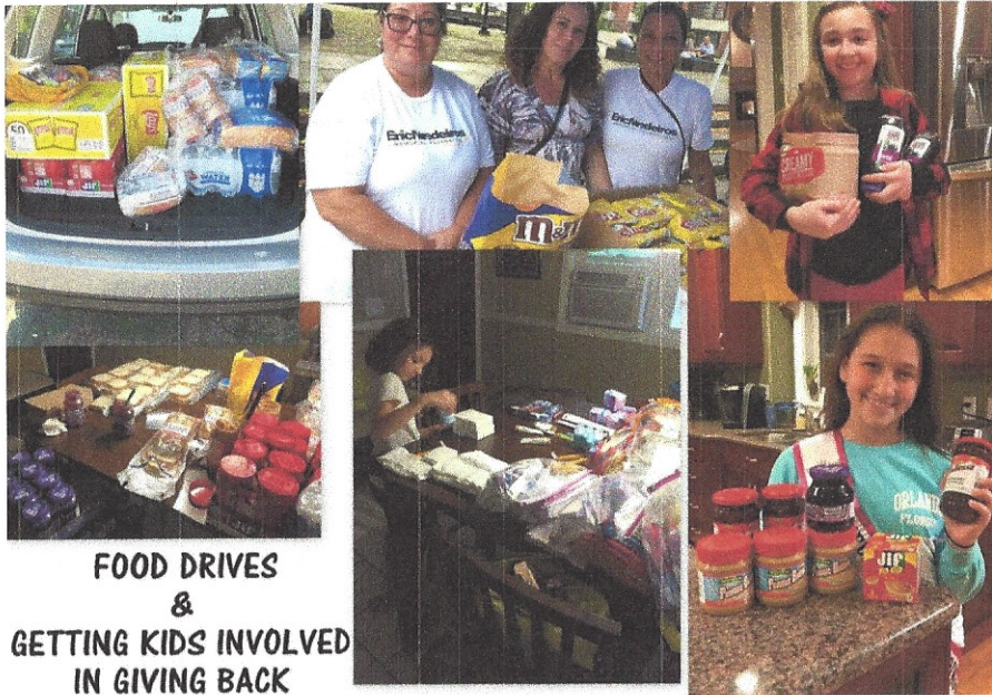
FOOD DRIVES & GETTING KIDS INVOLVED IN GIVING BACK